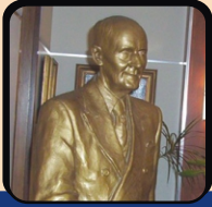
PAUL HARRIS FOUNDER THE ROTARY ORG